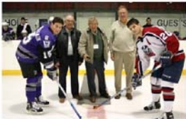
Western vs. Brock