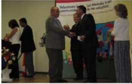
Ontario Volunteer Service Awards