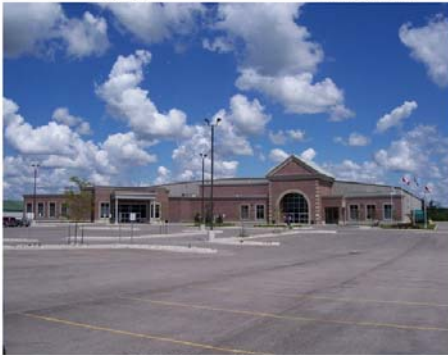
East Elgin Community Complex