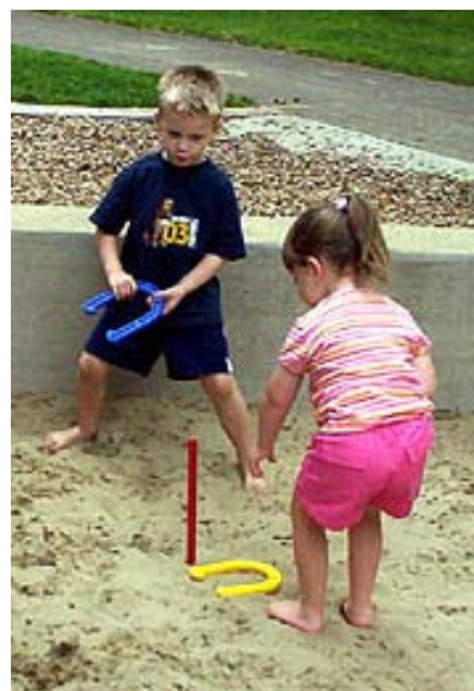
Never too young to start!